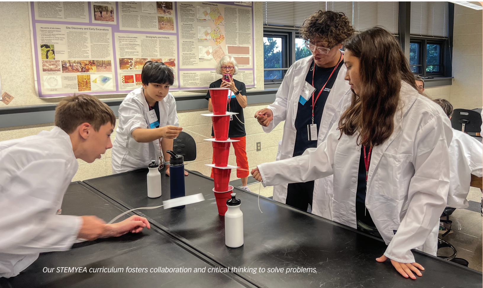
Our STEMYEA curriculum fosters collaboration and critical thinking to solve problems.