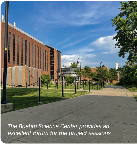
The Boehm Science Center provides an excellent forum for the project sessions.