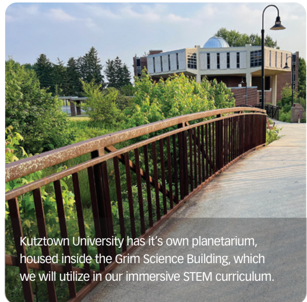
Kutztown University has it’s own planetarium, housed inside the Grim Science Building, which we will utilize in our immersive STEM curriculum.